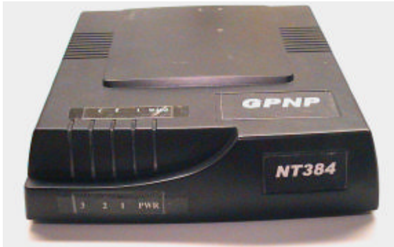
Figure 1. GPNP Inc NT384.

Figure 2 shows the power and interface connectors at the rear panel of NT384.