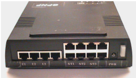
Figure 2. Power and Interface Connectors

Figure 2 shows the power and interface connectors at the rear panel of NT384.